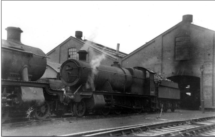
On 30 June 1957 2800 class 2861 is at home on Ebbw Junction shed. To its left is 4-6-0 5939 'TANGLEY HALL' from Old Oak Common.