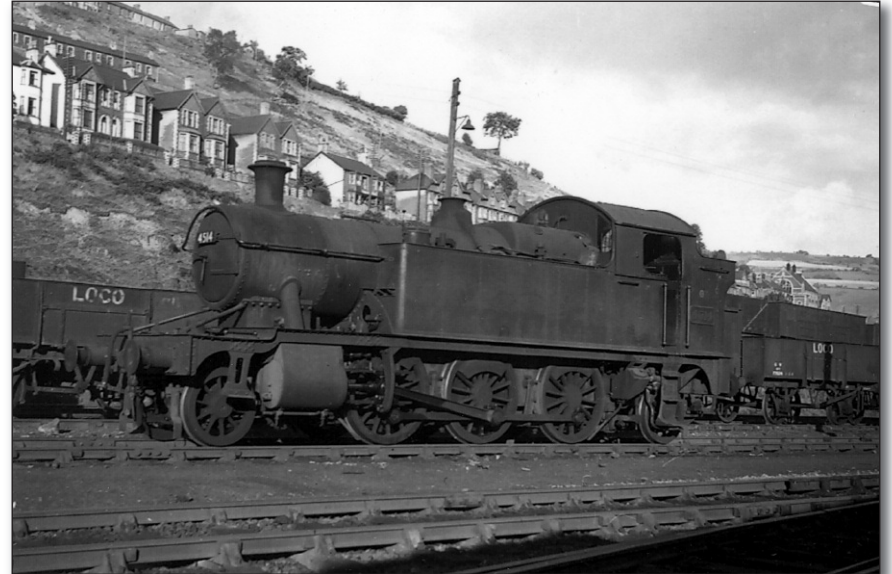
In 1950 4514 is at home at Aberbeeg shed. The loco does not carry a GWR ABEEG shed stencil and has not been fitted with a 86H shedplate.