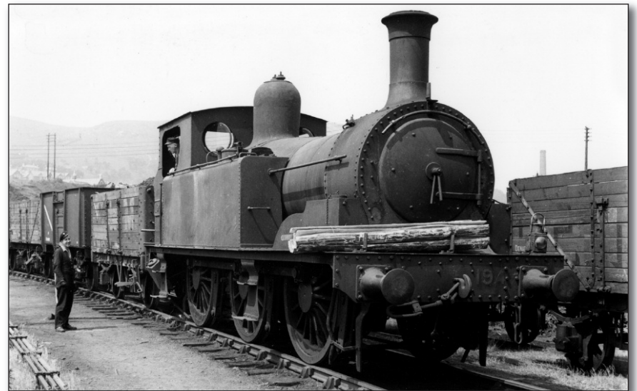
Taff Vale 194 shunts wagons at the foot of Pwllyrhebog Incline at Tonypany in June 1949. This loco was hired by Caerphilly Tar Works from November 1953 until May 1954.